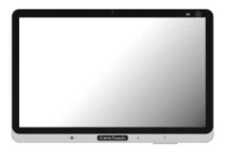
22" Widescreen Display