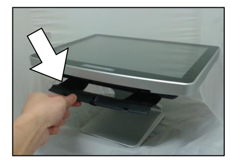
3. Push down IO cover to access IO ports.