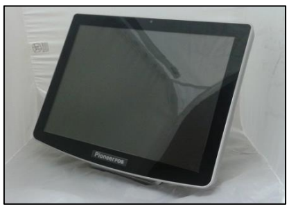
1. Sit terminal on a flat surface.