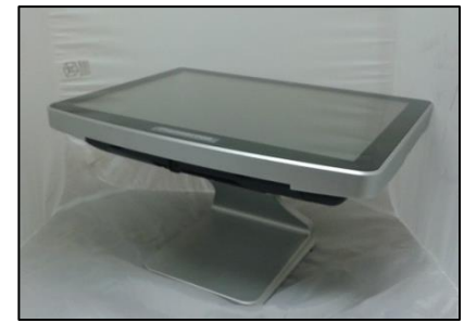
2. Tilt monitor head backward.