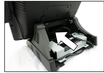
2. Route cables of peripherals through opening.