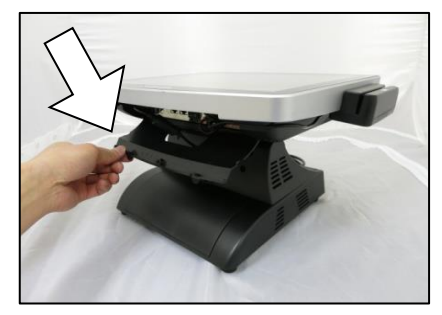
4. Push down IO cover to access IO ports.