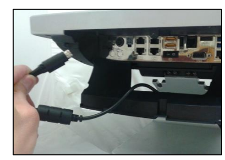
Connect power to IO port. Connect other cables as needed.