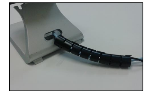
5. Organize cables using cable tube included in the package.