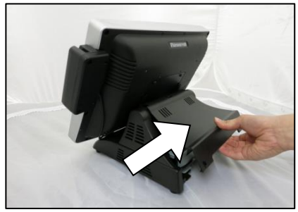
1. Lift up base back cover.